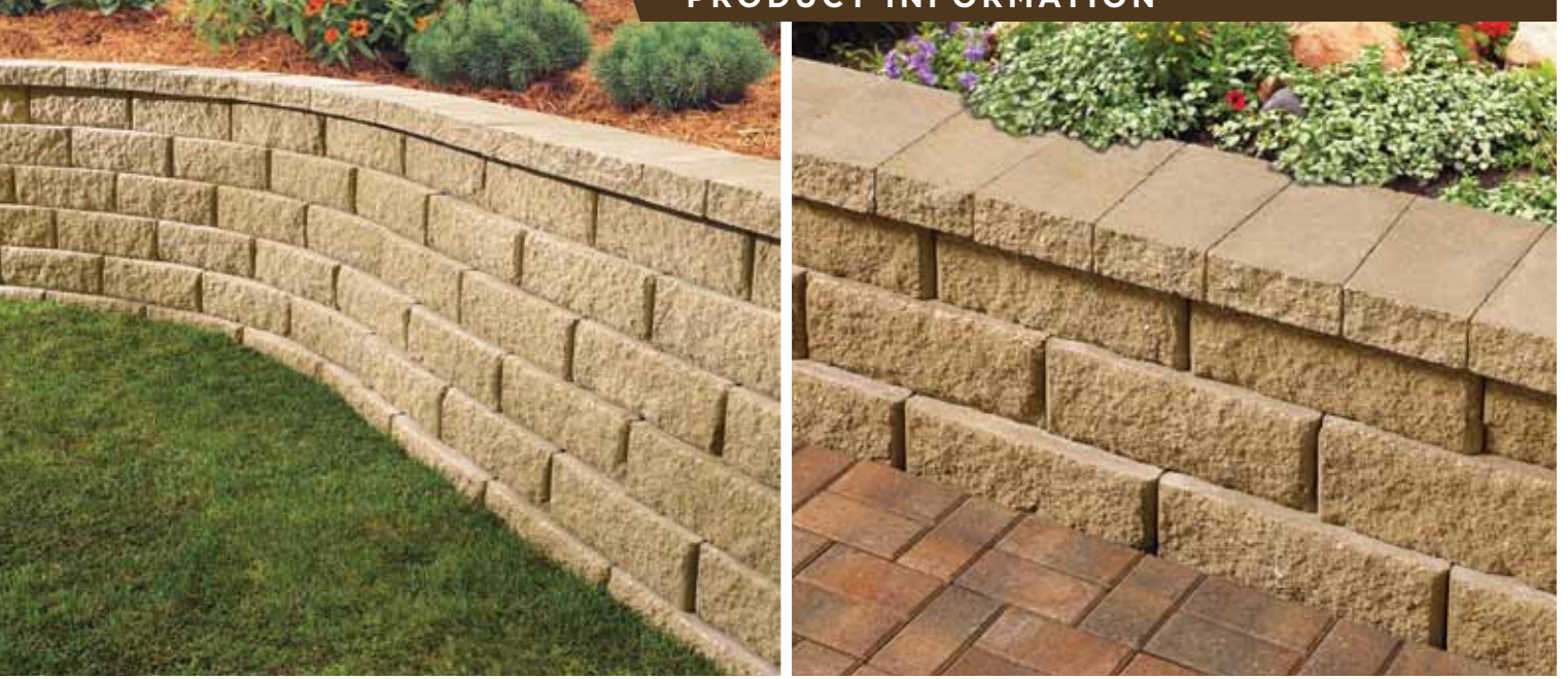
Visit anchorwall.com for installation instructions.